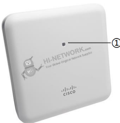
Figure 2 shows the AIR-AP1852I LED Indicator Position.