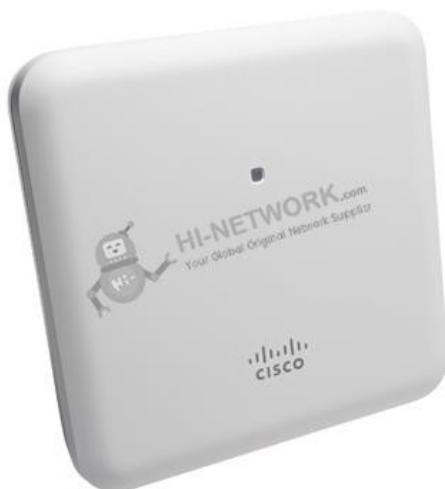
Figure 1 shows the appearance of the AIR-AP1852I-N-K9.